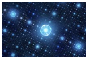
Pharmaceuticals and Chemicals