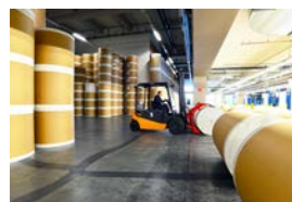
Pulp and Paper